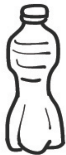
empty plastic bottle